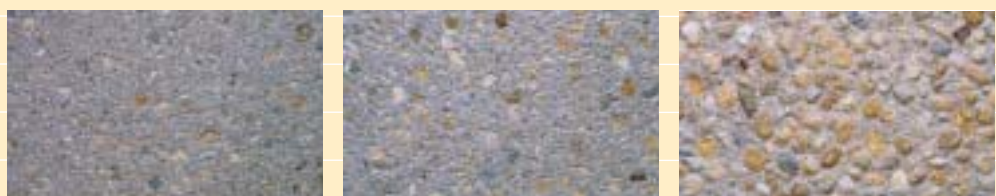
Examples of light, medium and heavy sandblast textures.

As with form liners, hand and power tools can be used to create an infinite variety of surface textures to precast. As if to confuse designers and specifiers, the precast industry simply names the use of any tool for this purpose as bushhammering. Specifications for uniformity or non-uniformity of tooled finishes are extremely difficult to write and assistance should be sought from a precaster providing the tooled finish being specified.