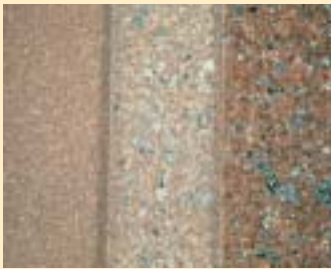
The single concrete mix shown here has three different finishes. From left to right, they are acid etch, sandblast and retarded. This multiple-finish technique offers an economical, yet effective, way to heighten aesthetic interest.

Hoover advises that, "There are also practical limitations to depth and profile that should be considered for reveals having excessive depth." Excessively deep reveals may increase shadow lines but will necessitate greater panel thickness to overcome bowing and other undesirable effects of thinner panel section.