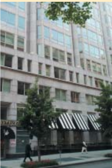
This example of domestic pink marble stone clad precast panels and glass and metal clad high rise office building shows minor mineral fading which has occurred since the building was constructed in 1989.

facility, but they are generically either specified as polished or textured. Polished finishes will bring out the full color, veining, and natural characteristics of a stone, while textured finishes will subdue them and cause the stone to look lighter.