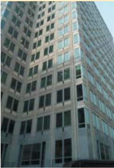
Example of black granite stone clad precast inset accents on architectural precast and glass and metal clad high rise office building.

using mortar or direct casting stone veneer to precast concrete panel backup.