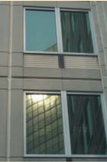
This closeup shows stone clad precast inset accents on high rise office building. Although the building was completed in 1991 the stone has not shown visual evidence of damage due to weathering.

cladding can be weakened by natural mineral inclusions occurring as pockets or veins and by fractures and microcracks caused by nature (inherent), fabrication, and erection stresses. Therefore, all proposed stone-cladding materials should be tested for their properties of strength and durability.