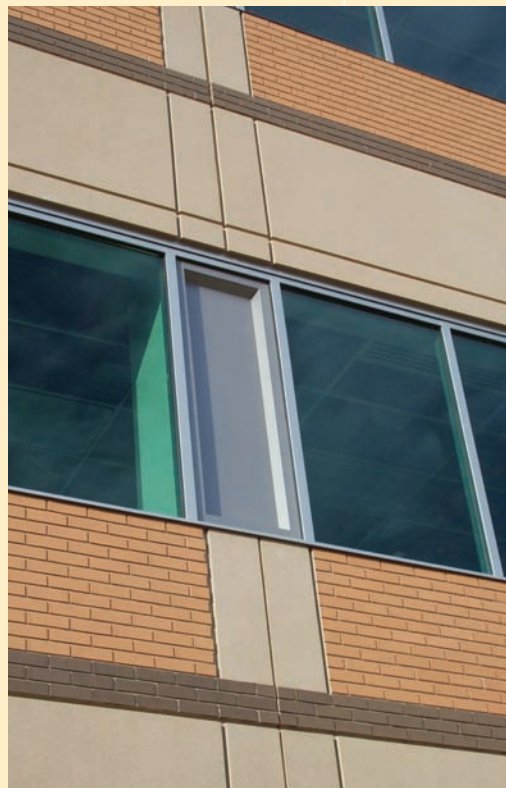
Close-up of orphaned light-colored, thin-brick units at accent field to vertical exposed precast column cover transition.

To be continued in the Summer 2003 issue.