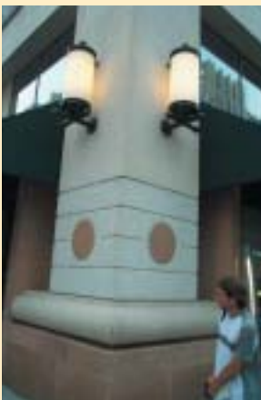
This example of granite is an inset accent recessed into precast panel field. Although the building was completed in 1985 the stone has not shown visual evidence of damage due to weathering.

Thousands of dimensional stone products and finishes are available in the commercial stone marketplace. Color-plate books such as MIA's Dimension Stones of the World assist designers in the preliminary selection of stone. Some finishes are proprietary to a stone quarry or fabrication