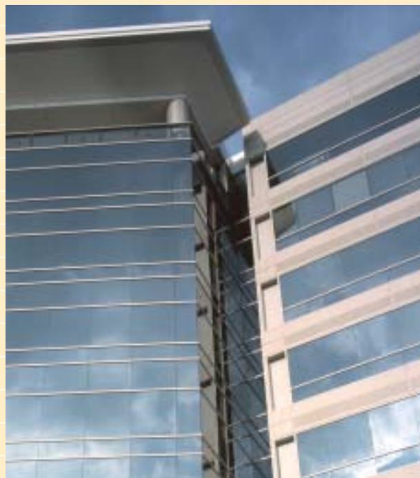
Detail of a glass to precast plane transition at the Waterway Plaza, The Woodlands, Texas. Note how the hue of the mix design complements the window frame coating. The precast panels were fabricated from a single mix containing white Portland cement, coarse aggregate (Texas Pink), and fine aggregates (Black Star, Big Sandy Sand, and White Sand). After casting, the panels they received light or medium sandblast texturing.