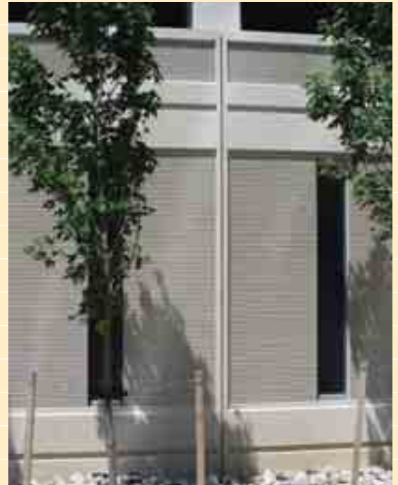
Landscaping, obscured glass, light, shade, shadow and attention to detailing at glass and horizontal rib terminations add interest and crisp clean lines to an ordinary parking garage screen wall at Discovery Square.

Most precasters want to know primarily what the coarse aggregates are to be. They have a number of good reasons. Their first concern is whether or not they will need to ship aggregates from remote quarries. Long-distance hauling, by truck or train, may have a large impact on the final panel cost. Aggregate type and size will play a major role in controlling unit water requirements, proportion of water to sand, cement content and workability. Grading variations and excessive fines can affect batch-to-batch color uniformity. Some aggregates may lack the necessary physical properties to withstand the desired finish texturing. Aggregates possessing high compressive strengths are recommended where high-pressure sandblast or ground-finish textures are required. Some aggregates may not be suitable for acid-washed finish textures as